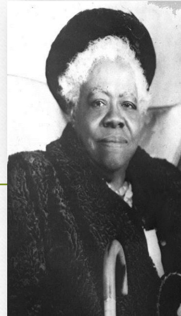
Mary McLeod Bethune

— Participant, Dialogue Day on African American Males