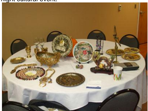
Another sample of items.