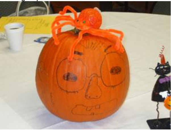
Another decorated pumpkin