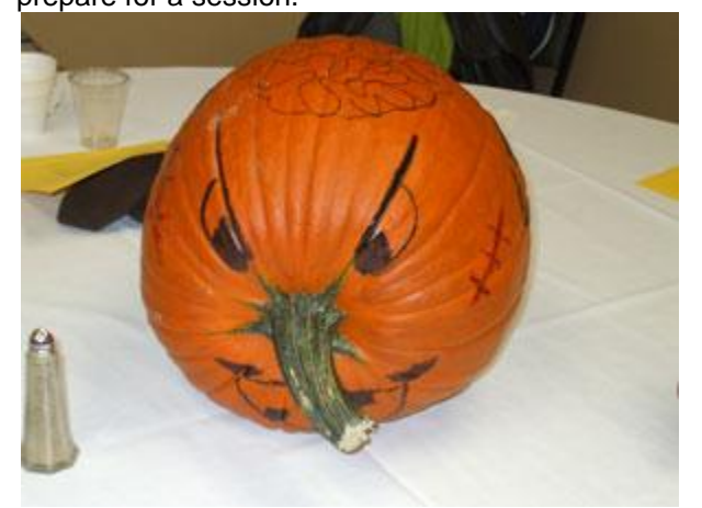
One of the decorated pumpkins