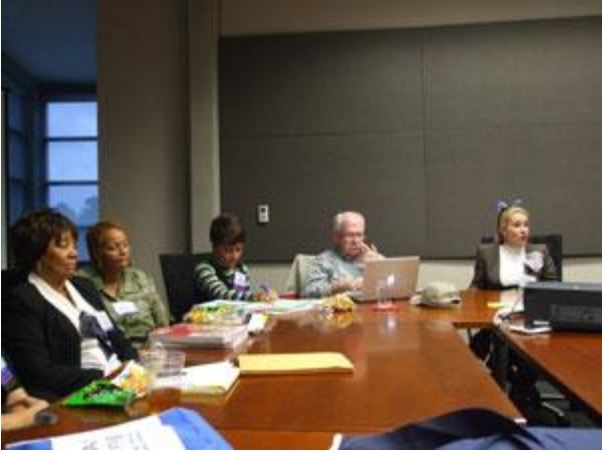
More scenes from the board meeting.