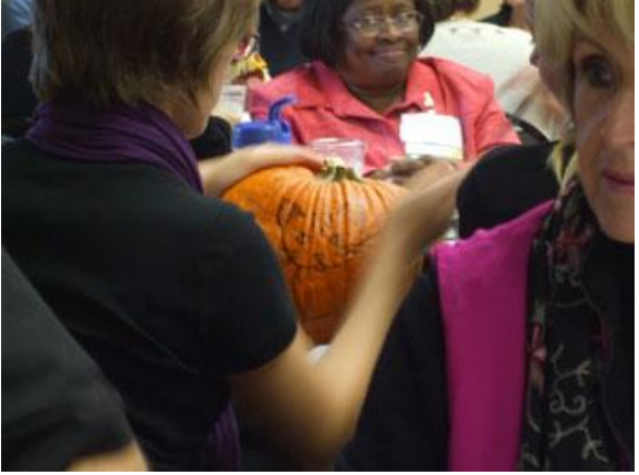
Pumpkin decorating was a popular pastime at whole-group sessions.