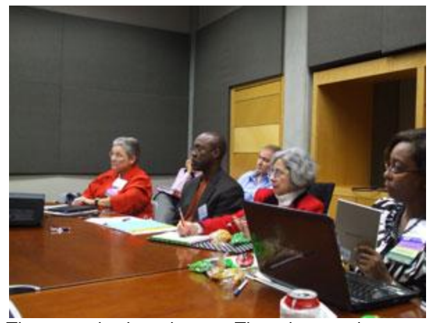
The executive board meets Thursday evening.