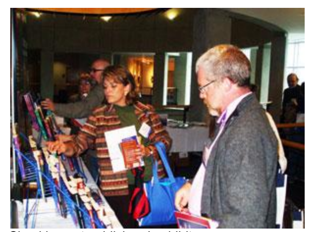
Checking out publishers' exhibits.