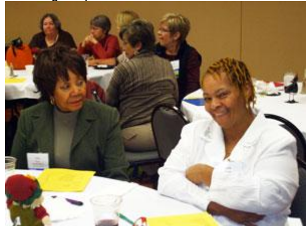
More table conversation